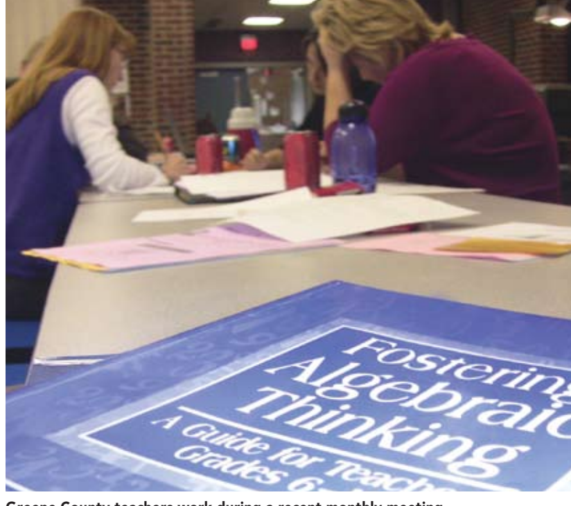
Greene County teachers work during a recent monthly meeting.

IU team helps teachers in one Indiana county introduce algebraic concepts earlier and more easily