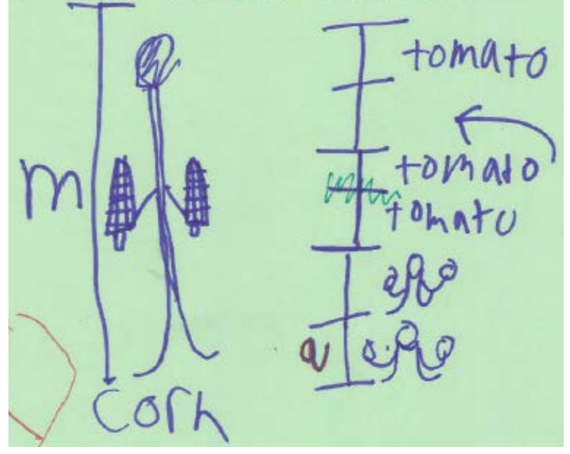
a. Picture and description of what the picture means.